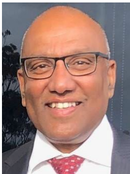
Chairman Sathya Sai College Limited Contact details: boardssc@sathyasai.nsw.edu.au