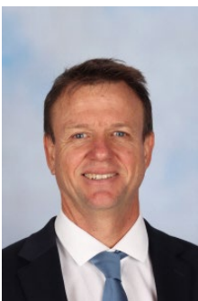
Deputy Principal, Sathya Sai College Contact details: deputy.d@sathyasai.nsw.edu.au